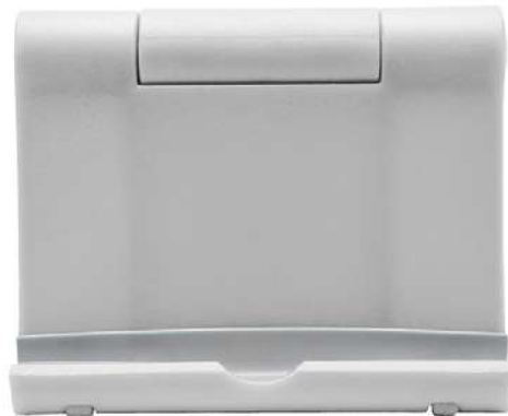
EP 1500 WHITE