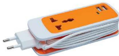
TA 0507 ORANGE