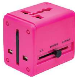
TA 0414 PINK