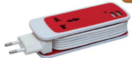
TA 0505 RED