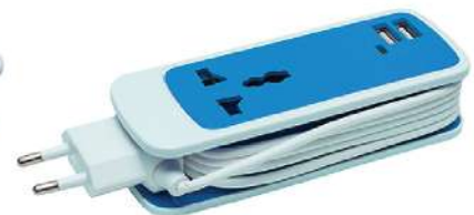
TA 0508 ROYAL BLUE