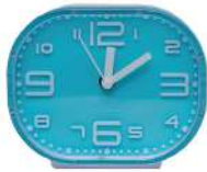
EP 0918 POWDER BLUE