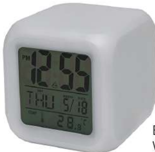
EP 1100 WHITE