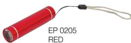
EP 0205 RED