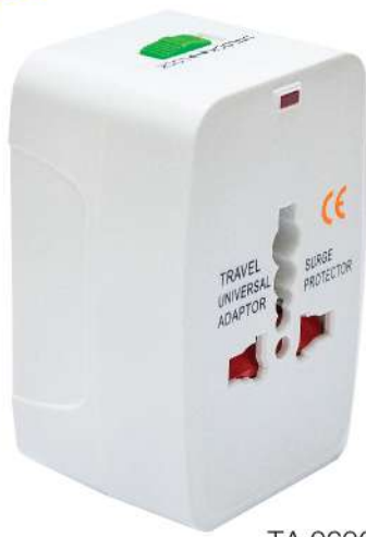
TA 0600 WHITE