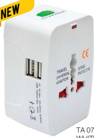
TA 0700 WHITE