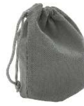
TA 0700 POUCH