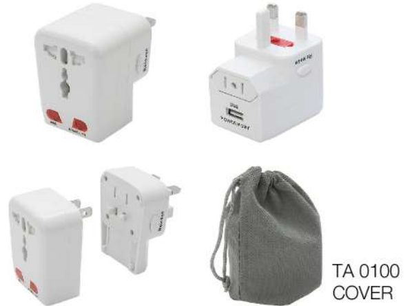
TA 0100 COVER