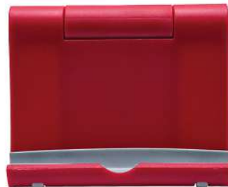
EP 1505 RED