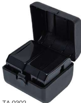
TA 0302 BLACK