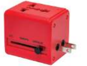
OPEN VIEW 3