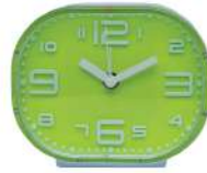
EP 0913 LIME GREEN