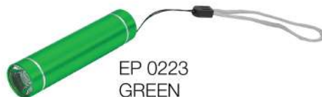
EP 0223 GREEN