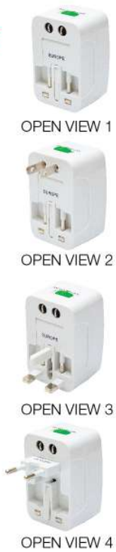
OPEN VIEW 1 OPEN VIEW 2 OPEN VIEW 3 OPEN VIEW 4