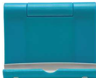
EP 1528 SEA BLUE