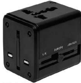
TA 0402 BLACK