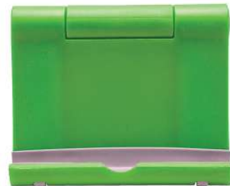
EP 1513 LIME GREEN