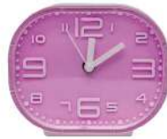
EP 0930 PURPLE