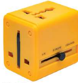
TA 0404 YELLOW