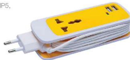
TA 0504 YELLOW