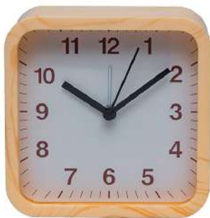
EP 1003 BEIGE