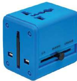
TA 0428 SEA BLUE