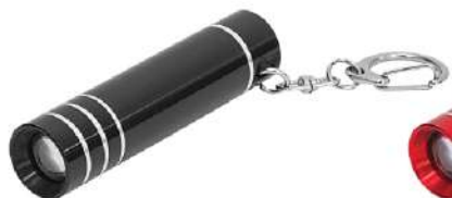
EP 0402 BLACK