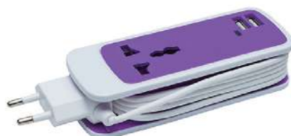
TA 0530 PURPLE