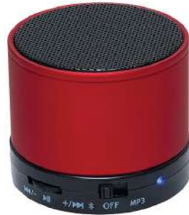
EP 1405 RED