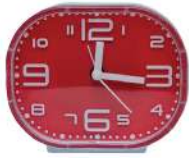
EP 0905 RED