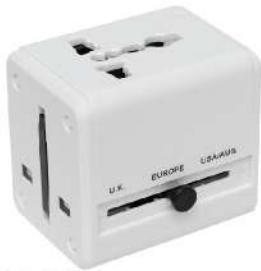
TA 0400 WHITE