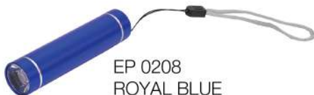
EP 0208 ROYAL BLUE