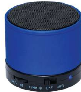
EP 1408 ROYAL BLUE