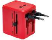
OPEN VIEW 1