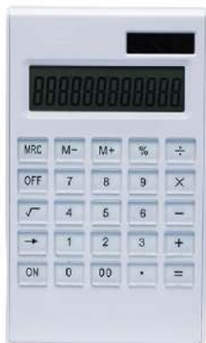
EP 0800 WHITE