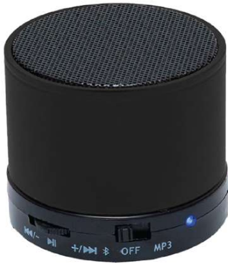
EP 1402 BLACK