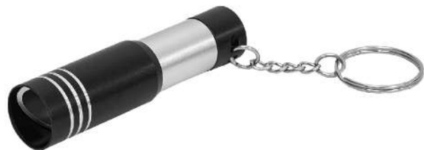
EP 0302 BLACK