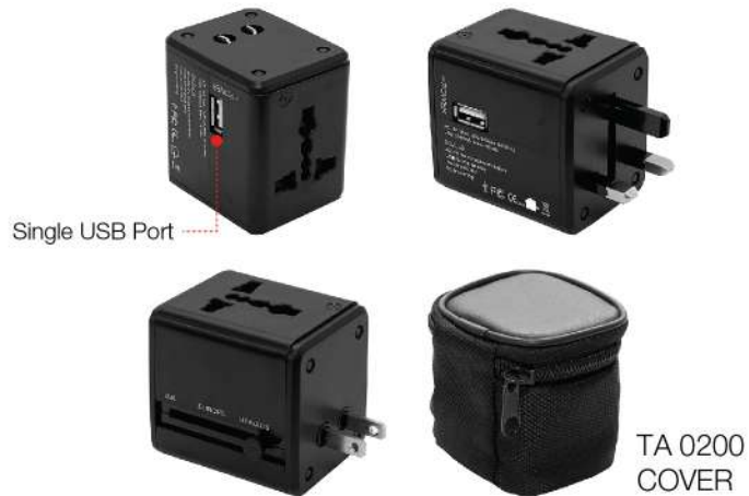
TA 0200 COVER