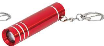
EP 0405 RED