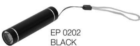
EP 0202 BLACK