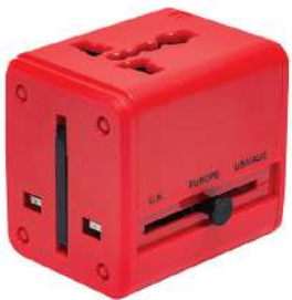
TA 0405 RED