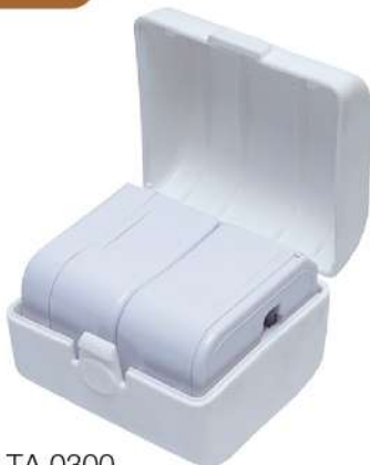
TA 0300 WHITE