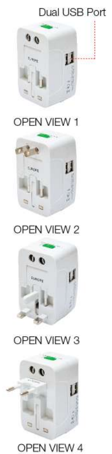
Dual USB Port OPEN VIEW 1 OPEN VIEW 2 OPEN VIEW 3 OPEN VIEW 4