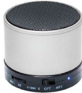
EP 1467 SILVER