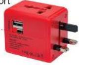
OPEN VIEW 2